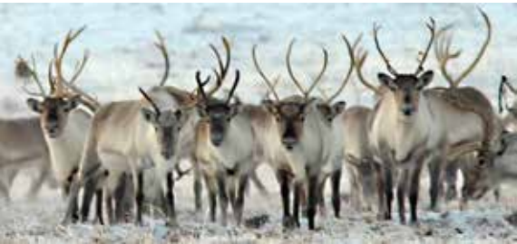
Prentun: Prentsmiðjan Oddi, júlí 2015.

32 Lónsöræfi Stafafellsfjöll The Stafafellsfjöll mountains, today also called Lónsöræfi, dominate the skyline east of Vatnajökull glacier and have long included one of Iceland's most extensive protected areas. Besides the deep, rugged canyons, the landscape displays a wide range of colours due to rhyolite and other attractive rocks. In contrast, there are lushly vegetated, sheltered valleys, and a good chance of spotting reindeer. The numerous trails make this a perfect hiking territory.